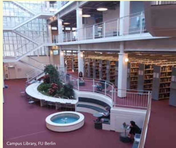
Campus Library, FU Berlin

Though the programme primarily focuses on the period from antiquity through to the late antique era, students who have not previously studied Persian will have the