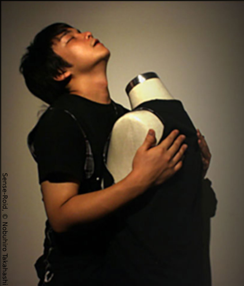
Sense-Roid, © Nobuhiro Takahashi

Freie Universität Berlin Oct 25–26, 2019