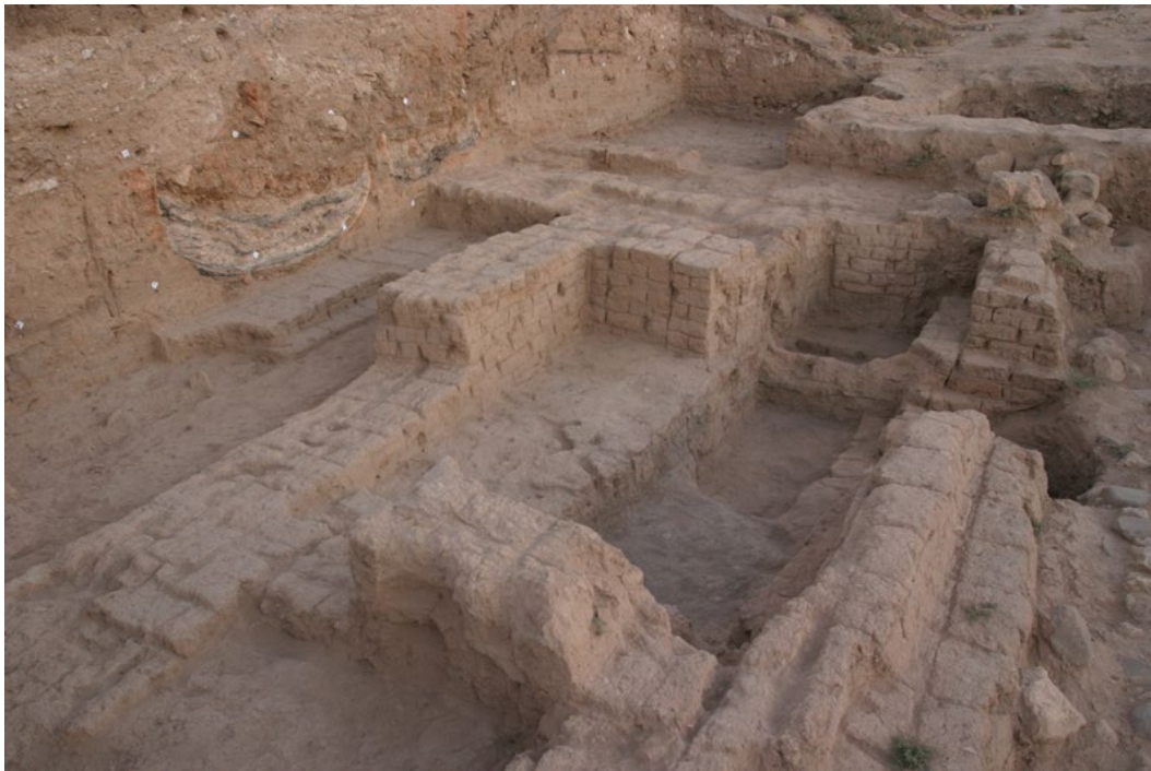
Fig. 4: Middle Assyrian Buildings II and III to the south.