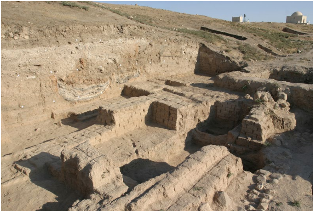
Fig. 1: General overview of the Sounding C, Middle Assyrian levels.

Further investigations in this area are aimed at both resolving the accurate date of the building complex and defining its character.