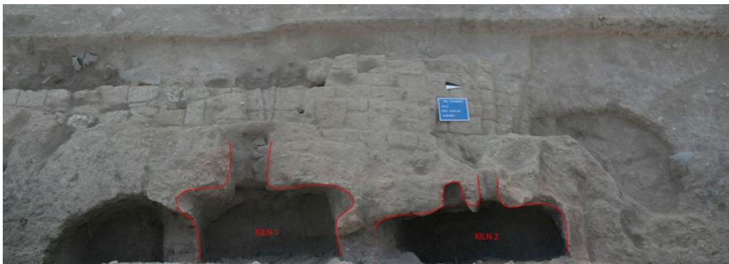
Fig. 2: Pottery Kilns embedded in mud-brick structure.