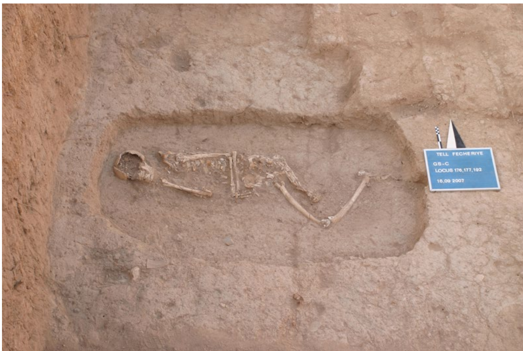
Fig. 6: Corps of burial beneath Middle Assyrian walls with heavy mutilations.