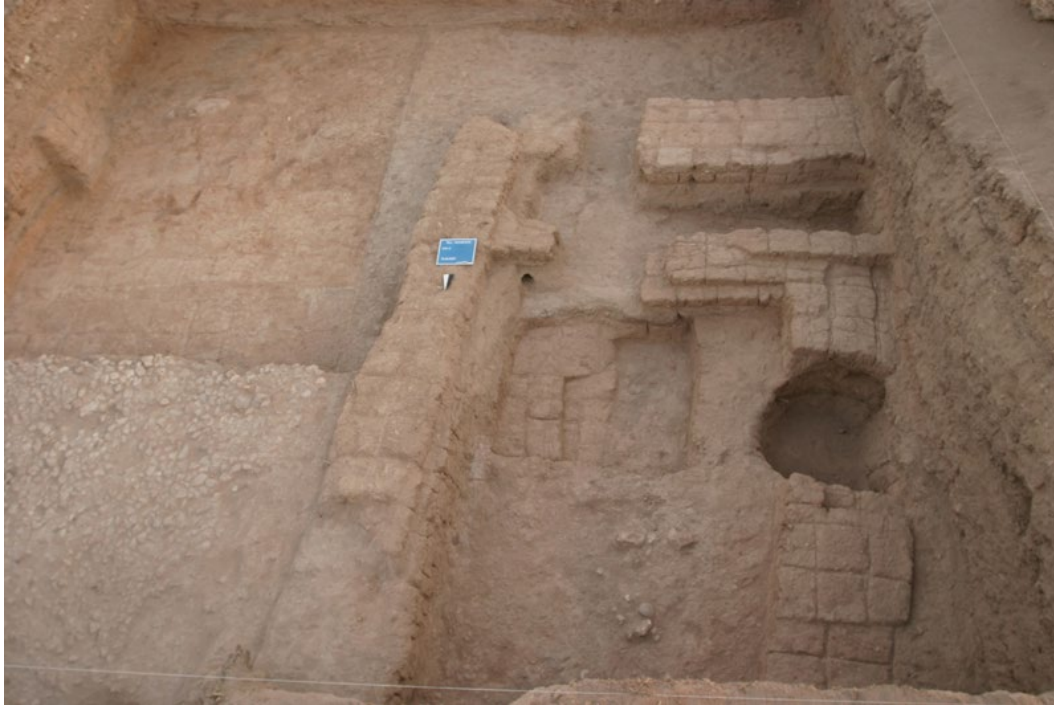
Fig. 5: The remains of the Middle Assyrian Building I after clearing the surface erosion that filled the trench since 1940 respectively 2001.