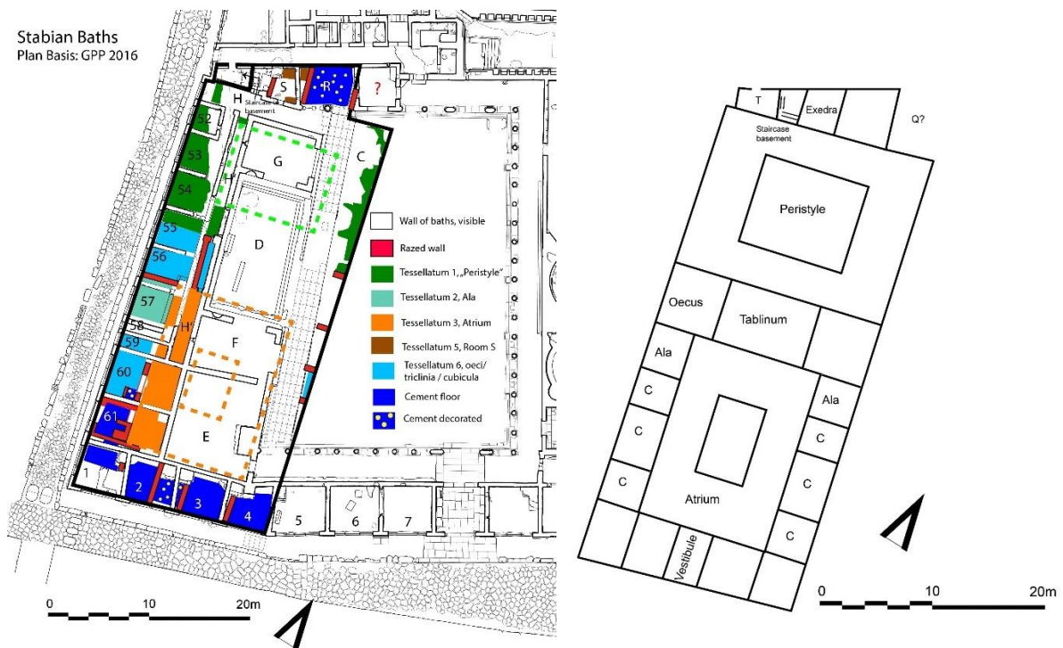
Fig. 11: Reconstruction of Atrium-Peristyle-House

In the southern part of corridor H’ (Trench XXXII), the mosaic floor of the atrium was revealed that been found in previous years in tabernae 57, 58, 60, and 61 (fig. 14). H. Eschebach had reconstructed the atrium with four columns, with the northwestern column located right in the southern part of corridor H’. But no evidence of a column base was found on the fully preserved mosaic floor. 2