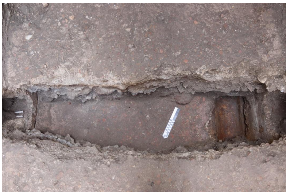
Fig. 10: Vestibule Ic, Trench XXXV: three cement floors on top of each other, the lower two with drainage channel along the W wall; ©FUB

The cleaning of vestibule Ic revealed a well-preserved cement floor. This had been cut in its southern part when an electricity cable was laid under A. Maiuri. When Maiuri's trench was emptied, two further cement floors were found 50cm below the uppermost floor. Both worked with a channel that had been made with the lowest floor and drained water from north (bathing rooms) to the Via dell'Abbondanza in the south. The lowest floor had the highest quality, the uppermost the lowest. The uppermost floor was made when the level was raised for 50cm in the Augustan period in the southern tabernae and the adjacent Via dell'Abbondanza, thus in phase 3 of the baths. The other two floors can be assigned to phases 1 and 2.