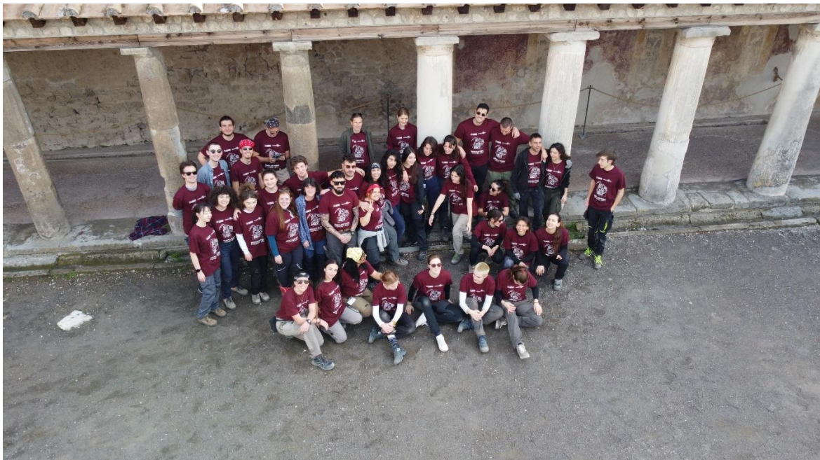
Fig. 1: Excavation Team, March 2023