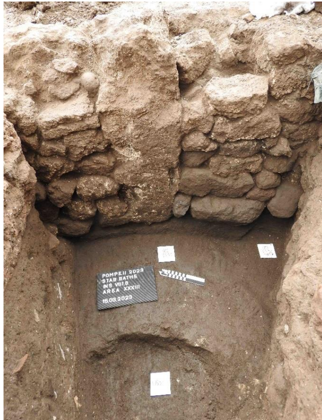
Fig. 4: Palaestra, Trench XXXIII, wall made of travertine and lava blocks

In taberna 1, a cistern with a caementitium vault was found under the cement floor of the house (figs. 5–6). In taberna 56, an east-west running wall made of travertine blocks was found under the well-preserved mosaic of the later house. While this could not be explored any further, it had the same orientation as the later house walls.