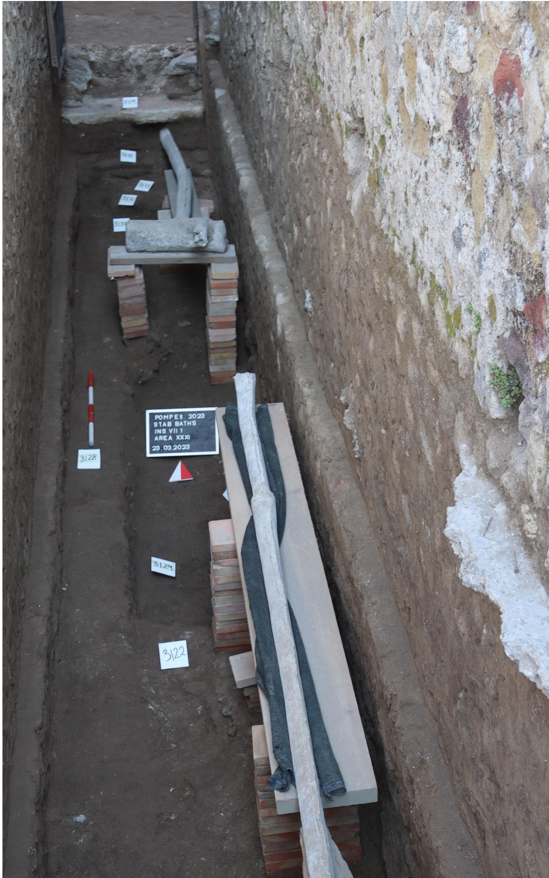
Fig. 13: Corridor H 2 , Trench XXXI, evidence of peristyle and lead pipe of pool and nymphaea