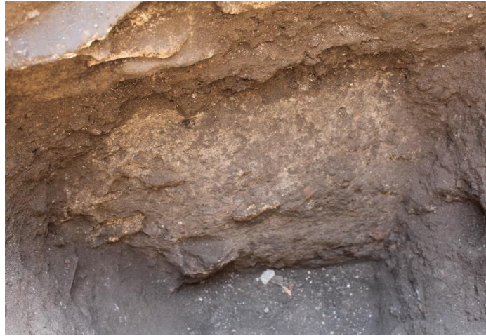
Fig. 6: Taberna 1, Trench XXXVI, caementitium vault of cistern under cement floor of house; ©FUB