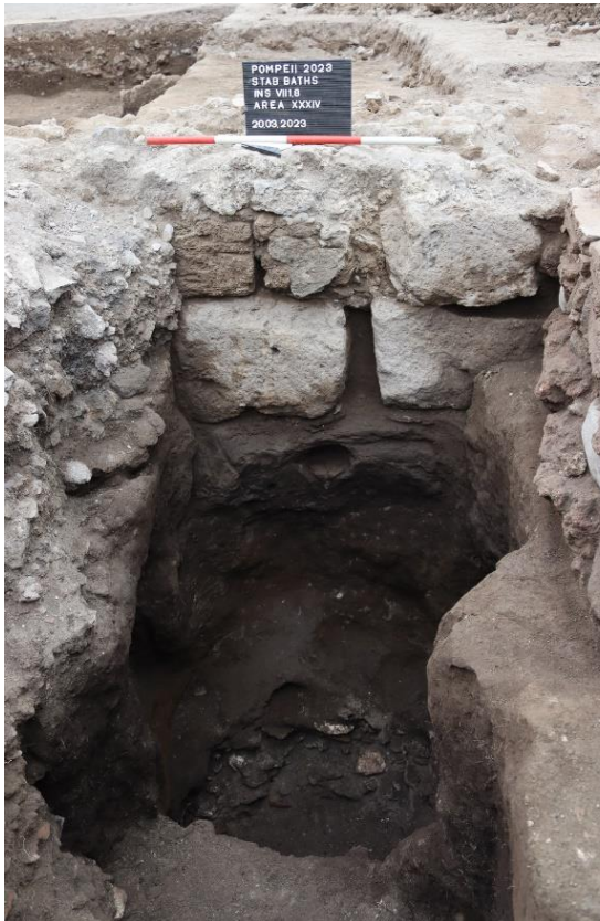
Fig. 3: Palaestra, Trench XXXIV, wall made of tuff and travertine blocks

The most important wall is a north-south running wall made of large blocks of tuff and travertine and built directly on grey ash. This was revealed in trenches XXXIII and XXXIV in the palaestra, preserved to a height of 1m (figs. 3–4). It was reused when the baths were built as the west boundary of the palaestra.