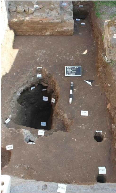
Fig. 5: Taberna 1, Trench XXXVI, cement floor of house