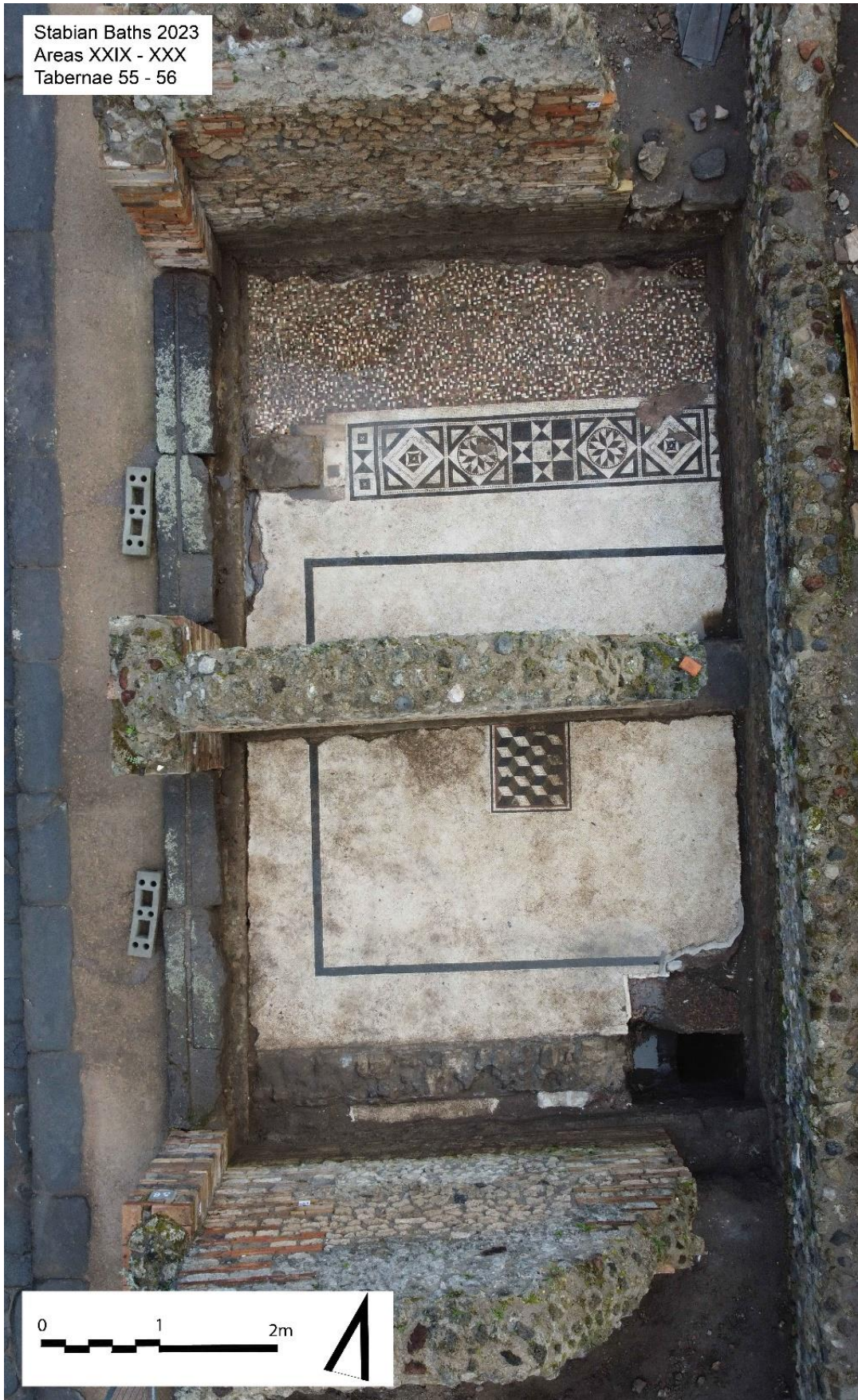
Fig. 12: Tabernae 55–56, Areas XXIX–XXX, mosaic floors of oecus and S portico