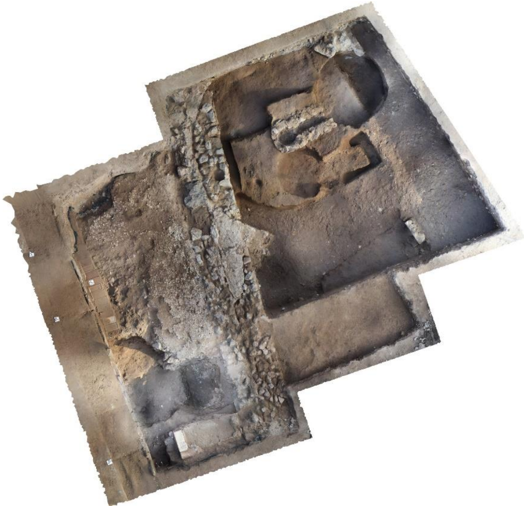
Fig. 7: Palaestra, Trench XXXIV, small laconicum