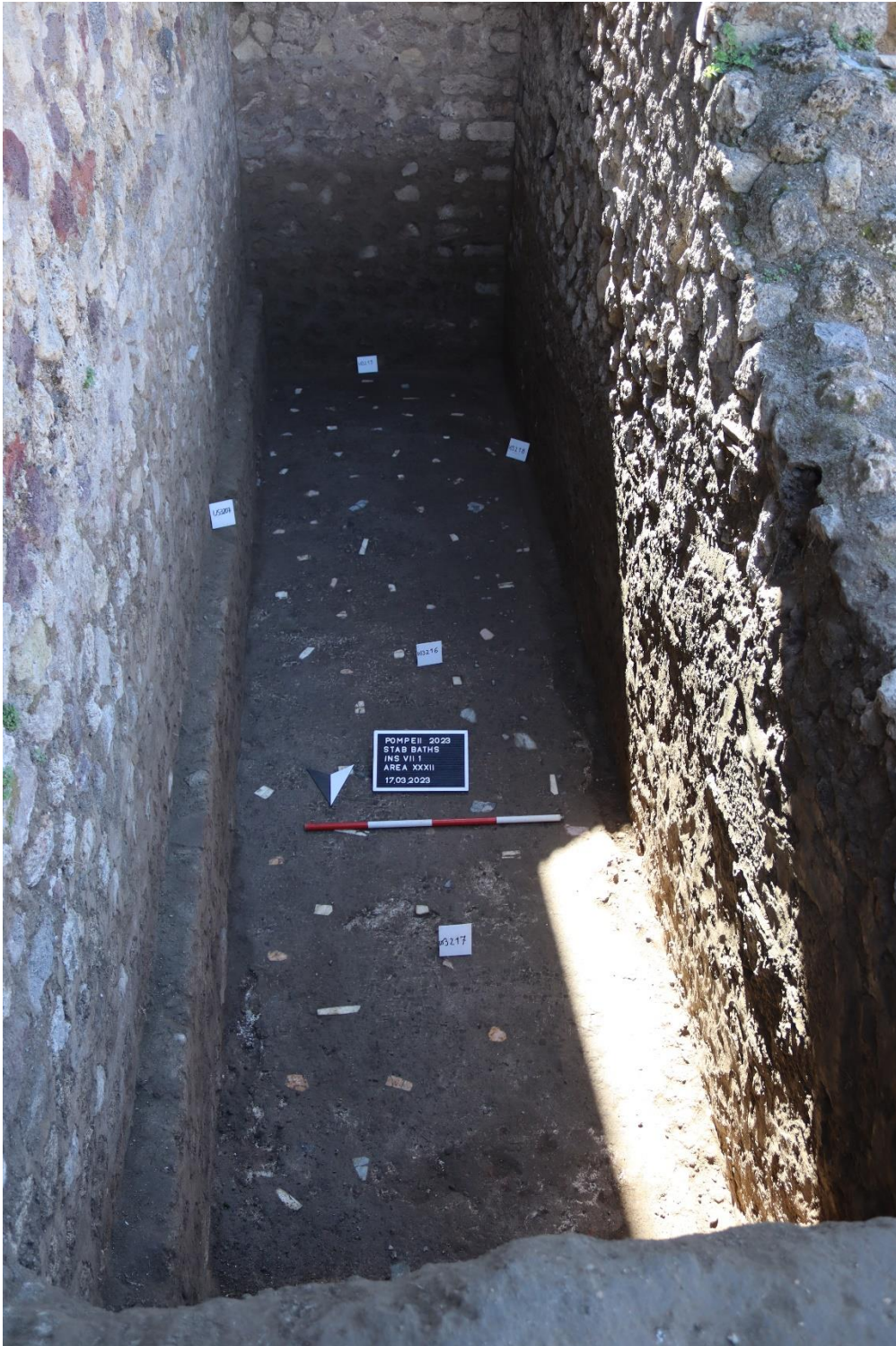
Fig. 14: Corridor H', Trench XXXII, mosaic floor of atrium

Marco Giglio – Monika Trümper mgiglio@unior.it – monika.truemper@fu-berlin.de