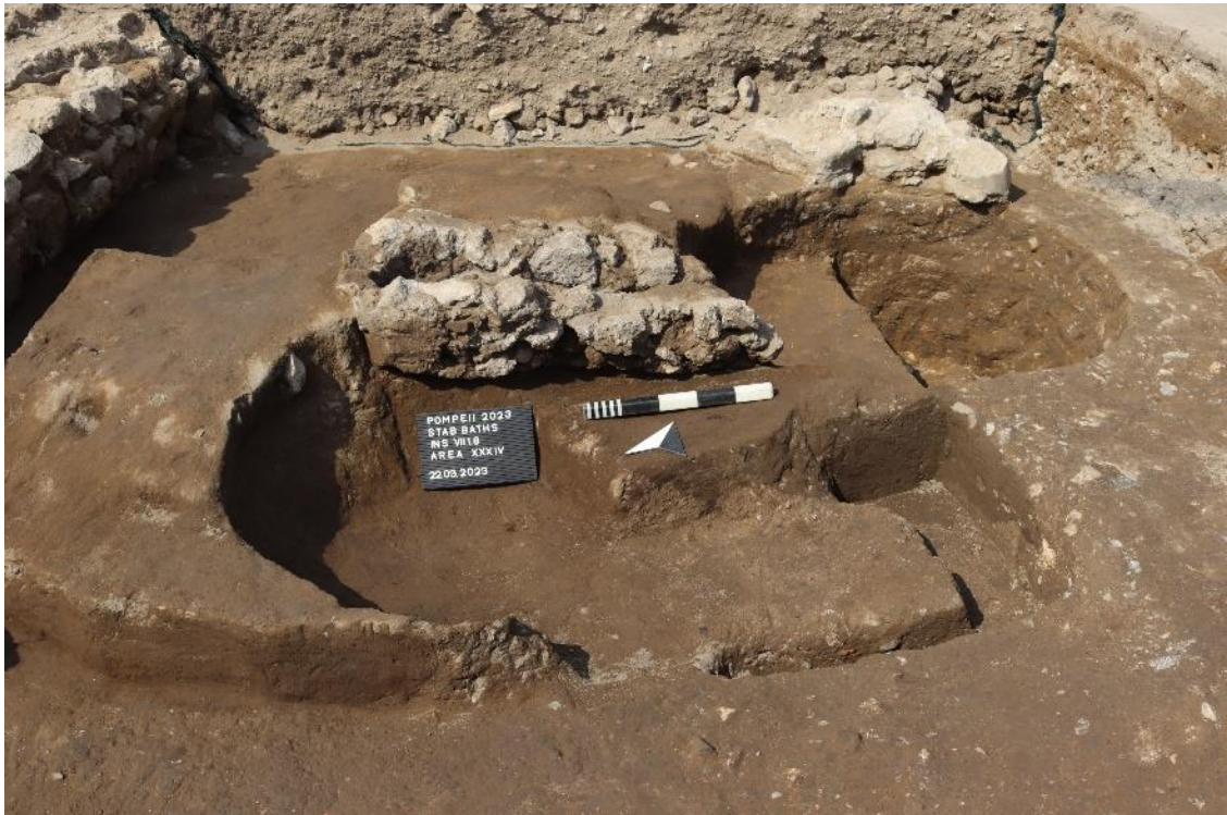
Fig. 8: Palaestra, Trench XXXIV, small laconicum: furnace and pits